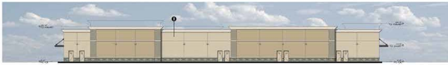
SHOPS ELEVATION (NORTH)