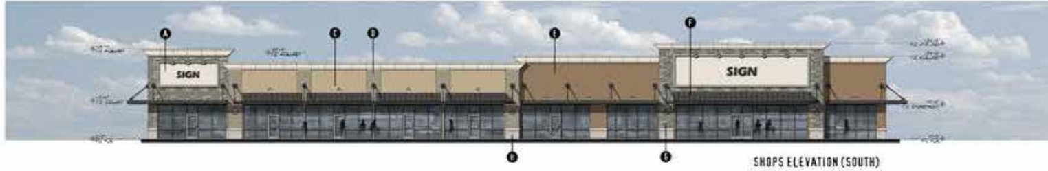
SHOPS ELEVATION (SOUTH)